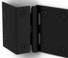
5 knuckle hinge