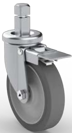
5" diameter post caster