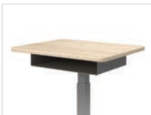
Desk Storage Box

See spec guide for additional accessories