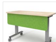
PET Felt Modesty Panel

See spec guide for more detail on size combinations. Accessories are not available on all worksurface sizes/shapes.