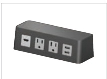
Burele - power

See spec guide for additional accessories