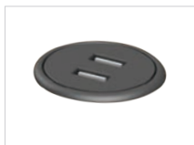
Salt power unit