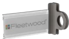
Hasp lock & identification holder on wire grille doors