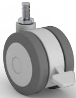
75mm locking caster (Mobile instruments storage)