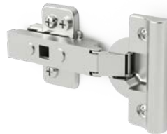
120° soft-close european hinge