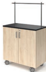
3D PRINTER CART Locking door & drawer W: 36" D: 20" H: 37"