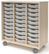
TRAY W: 42" D: 20" H: 24, 29, 37, 44"