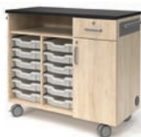
PROJECT CART Locking door & drawer W: 42" D: 20" H: 29, 37"