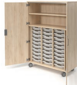
TRAY SHELF WITH DOORS Locking doors W: 48" D: 20" H: 44, 68"