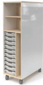
MARKERBOARD WITH TRAY STORAGE W: 36" D: 20" H: 68" 20 trays - 10/side