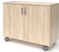
TRAY WITH DOORS Locking doors W: 48" D: 20" H: 24, 29, 37, 44"