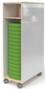
MARKERBOARD WITH FLOOR CUSHION STORAGE W: 36" D: 20" H: 68" 30 floor cushions-15/side Cushions not included