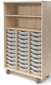
TRAY SHELF W: 42" D: 20" H: 44, 68"