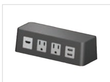
Burele - power

See spec guide for additional accessories