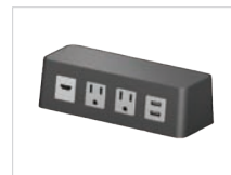
Burele - power