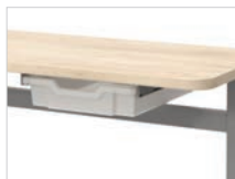
Gratnells Tray and Rails