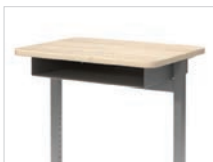
Desk Storage Box

See spec guide for additional accessories