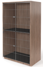
Compartment doors with hasp locks