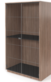
Full length doors with hasp lock