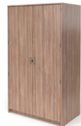
Doors with hasp lock