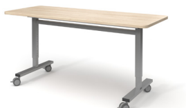
FLIP & NEST