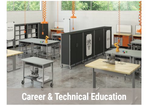
Career & Technical Education