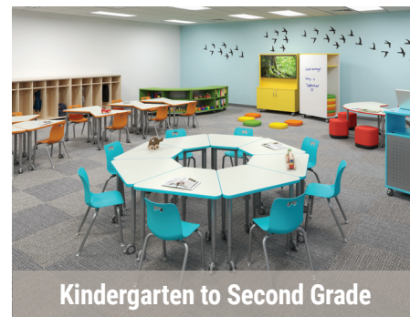
Kindergarten to Second Grade