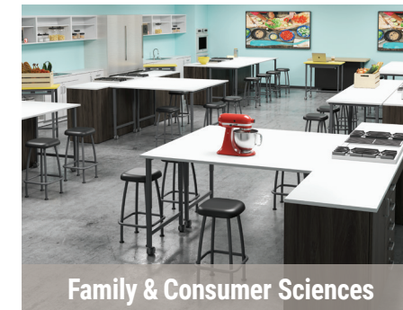
Family & Consumer Sciences