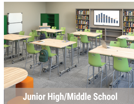
Junior High/Middle School