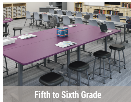
Fifth to Sixth Grade