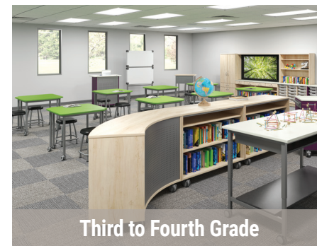
Third to Fourth Grade