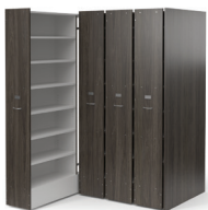
MUSIC STORAGE SYSTEM