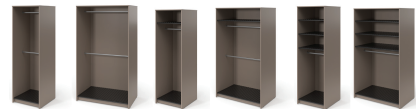
GARMENT - 1-2 GARMENT RODS, 0-3 SHELVES NO DOORS AND LOCKING DOORS