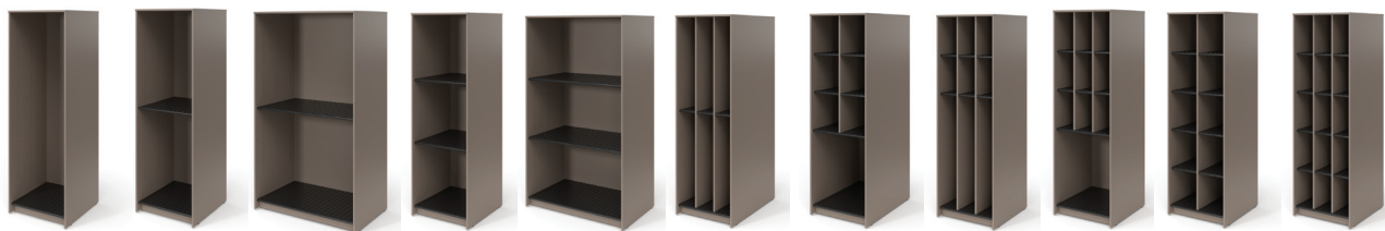
INSTRUMENT - 1-15 COMPARTMENTS NO DOORS AND LOCKING DOORS