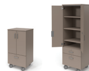
SHELF DRAWER - LOCKING DOORS