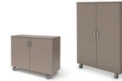
TRAY AND TRAY-SHELF WITH DOORS