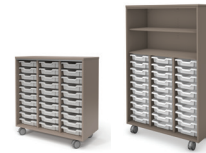
TRAY AND TRAY-SHELF