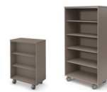
SHELF - STRAIGHT