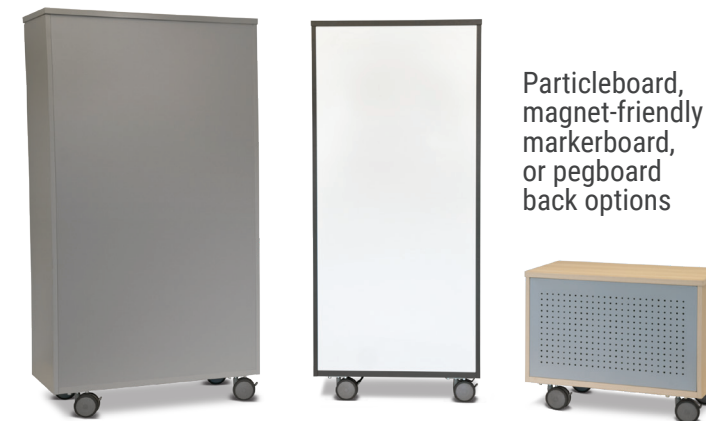
Particleboard, magnet-friendly markerboard, or pegboard back options