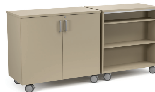
Available with or without doors