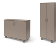
CUBBY WITH DOORS