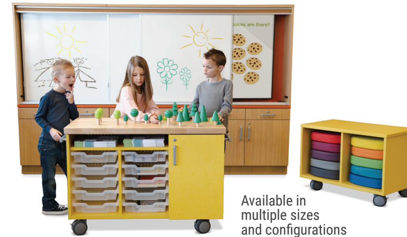
Available in multiple sizes and configurations