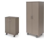
SHELF - STRAIGHT WITH DOORS