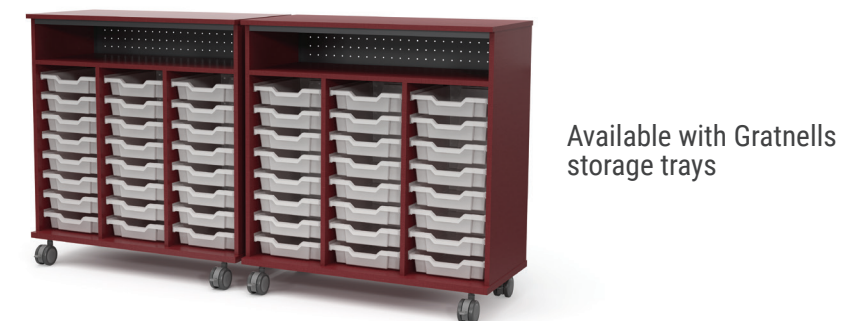
Available with Gratnells storage trays