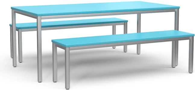
BENCH WITH PICNIC TABLE Table Heights: 24", 29" Widths: 60", 72" Depths: 30", 36"