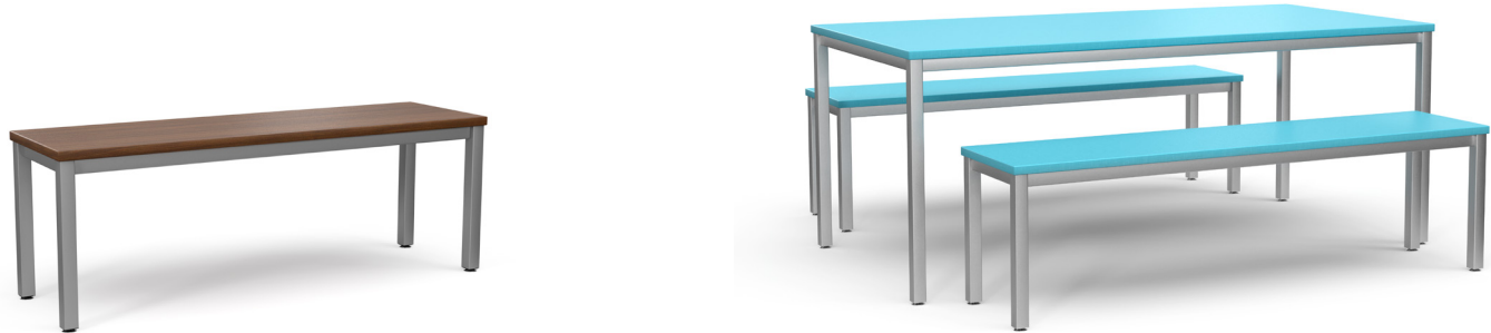
BENCH Heights: 14", 18" Widths: 51", 63" Depth: 15"

Our sturdy, welded-frame bench complements our picnic table and provides alternate seating solutions in common areas, hallways, administrative waiting areas and other social spaces.