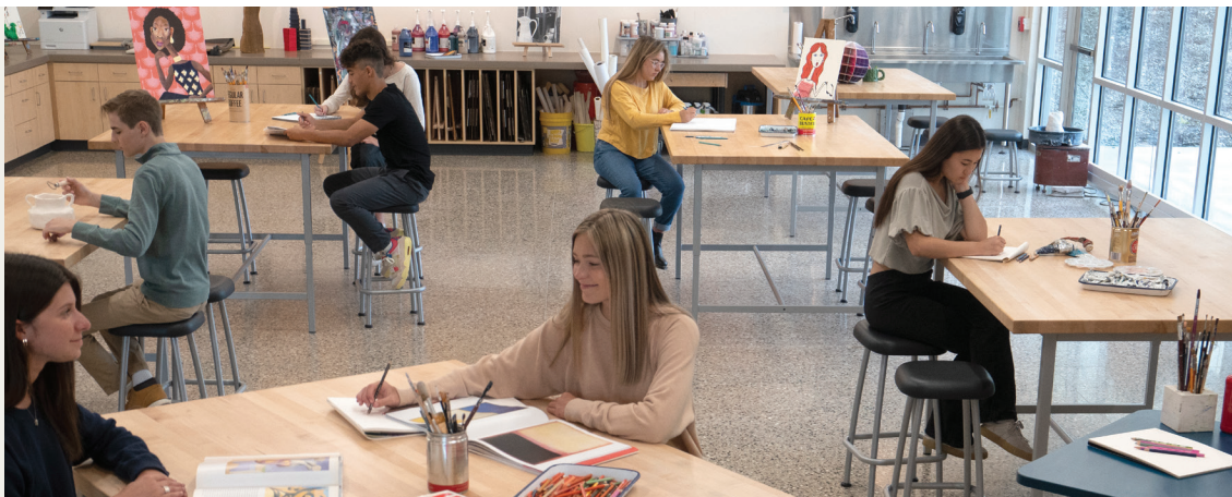
SINGLE-STUDENT • TWO-STUDENT • GROUP • TEACHER