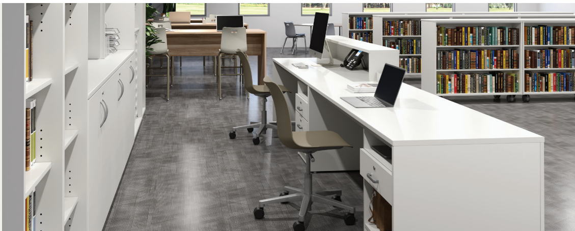
TEACHER • ADMINISTRATION

See the Library 2.0 section, page 98, for individual units.