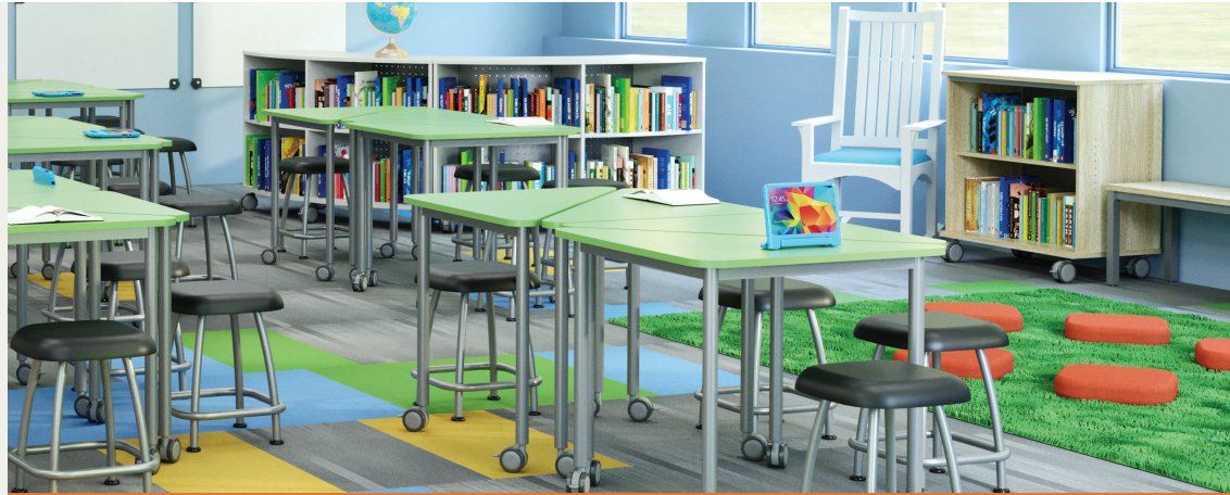
SINGLE-STUDENT • TWO-STUDENT • GROUP