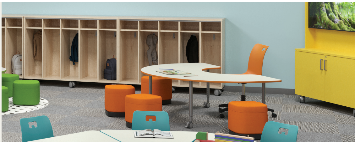
SINGLE-STUDENT • TWO-STUDENT • GROUP • TEACHER