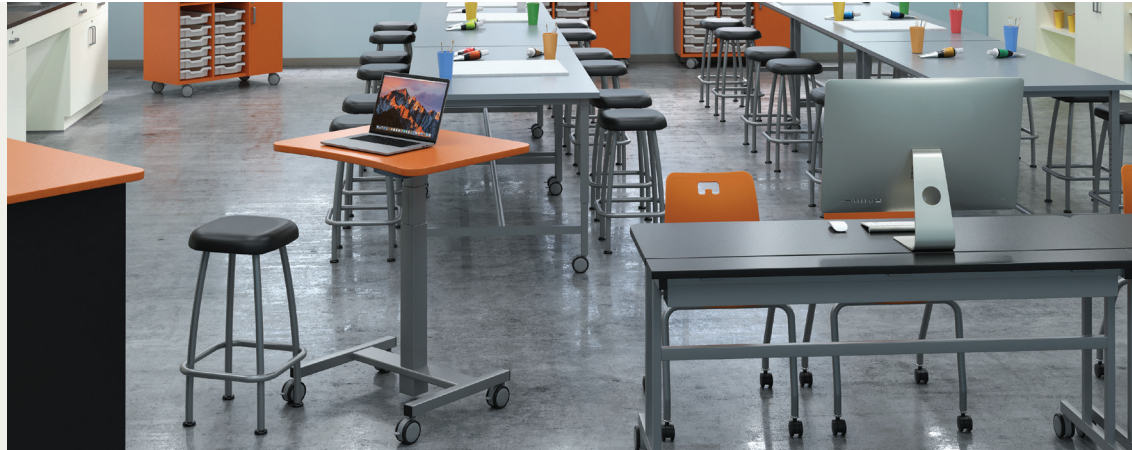
SINGLE-STUDENT • TWO-STUDENT • GROUP • TEACHER