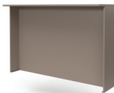
MONITOR HUTCH LEARNING WALL - NO DOORS