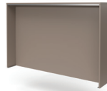
MONITOR HUTCH - NO DOORS