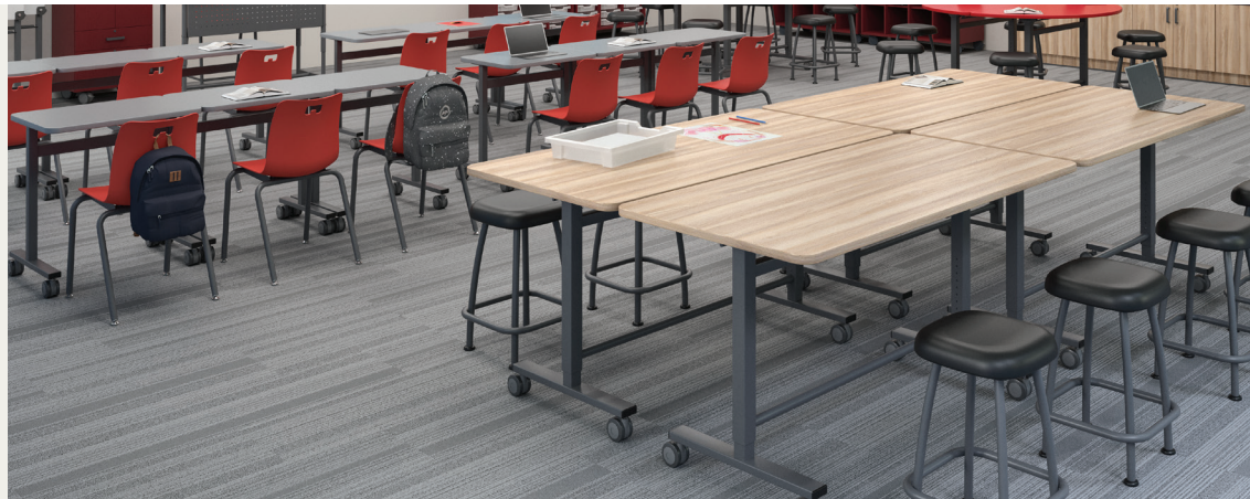
SINGLE-STUDENT • TWO-STUDENT • GROUP • TEACHER