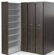
MUSIC STORAGE SYSTEM