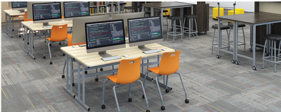
SINGLE-STUDENT • TWO-STUDENT • TEACHER