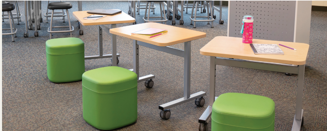
SINGLE-STUDENT • TWO-STUDENT • TEACHER