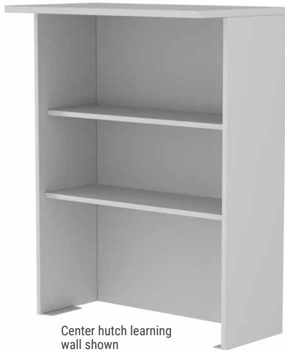
Center hutch learning wall shown