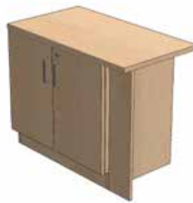
BASE STORAGE FRONT FILLER (Shown in application)