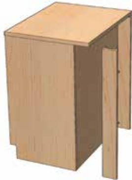
BASE STORAGE SIDE FILLER