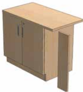
BASE STORAGE SIDE FILLER