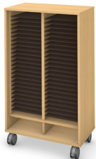
Harmony Folio Storage, Mobile, No Doors 29"w x 50"h x 18"d 50 openings - 563000.351