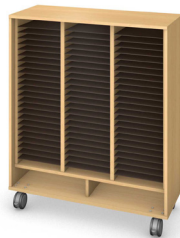
Harmony Folio Storage, Mobile, No Doors 42"w x 50"h x 18"d 75 openings - 563100.551