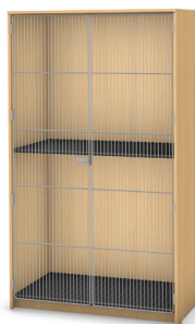
Harmony Instrument Storage, 2 Compartment

Accommodates: String Bass, Cello, Contra Bass Clarinet or Bass Drum