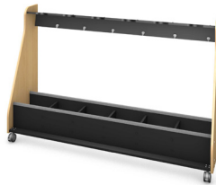
Harmony Cello Storage, Mobile, 6 instruments 73"w x 47"h x 24"d - 564300