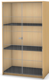
Harmony Instrument Storage, 3 Compartment

48" w x 84" h x 30" d No Doors - 560310.443 Full Wire Doors* - 560311.443 Compartment Wire Doors* - 560316.443