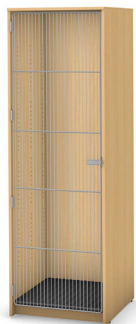
Harmony Instrument Storage, 1 Compartment

Woodwind, Brass, Percussion, Guitar, Strings