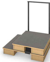
Harmony Conductor Podium 43"w x 48"h x 38"d 566200.000