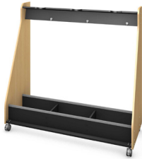
Harmony Bass Storage, Mobile, 3 instruments 61"w x 60.5"h x 26"d - 564000