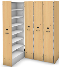
Harmony Music Storage System

48"w x 84"h x 30"d - 20 Uniforms No Doors - 562210.443 Full Laminate Doors** - 562212.443 27"w x 84"h x 30"d - 11 Uniforms No Door - 562210.243 Full Laminate Door** - 562212.243