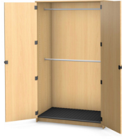
Harmony Garment Storage, 2 Rods - No Shelves

48"w x 84"h x 30"d - 40 Uniforms No Doors - 562110.443 Full Laminate Doors** - 562112.443 27"w x 84"h x 30"d - 22 Uniforms No Door - 562110.243 Full Laminate Door** - 562112.243