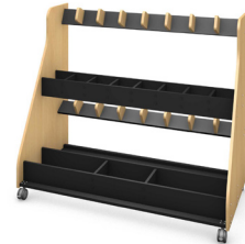
Harmony Violin Storage, Mobile, 16 instruments 61"w x 50"h x 33"d - 564400