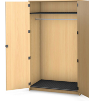
Harmony Garment Storage, 1 Rod - 1 Shelf

48"w x 84"h x 30"d - 40 Uniforms No Doors - 562110.443 Full Laminate Doors** - 562112.443 27"w x 84"h x 30"d - 22 Uniforms No Door - 562110.243 Full Laminate Door** - 562112.243