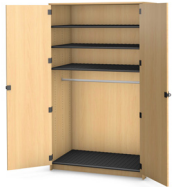
Harmony Garment Storage, 1 Rod - 3 Shelves

48"w x 84"h x 30"d - 20 Uniforms No Doors - 562010.443 Full Laminate Doors** - 562012.443 27"w x 84"h x 30"d - 11 Uniforms No Door - 562010.243 Full Laminate Door** - 562012.243