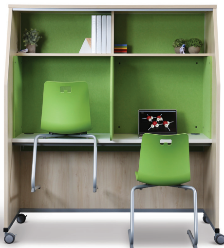
Create a learning space solution that includes everyone, anywhere.