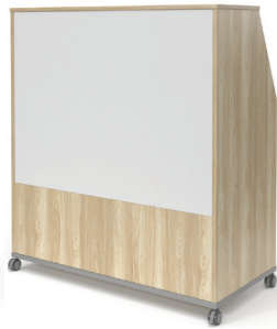
Markerboard back on MLS Double - Tall

PET FELT OPTIONS See spec guide for laminate options