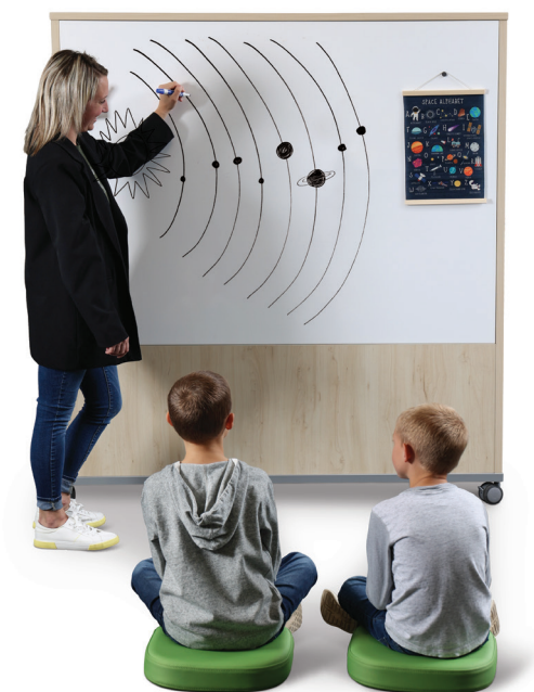
Markerboard back on the Tall MLS creates an additional learning space perfect for small group instruction.