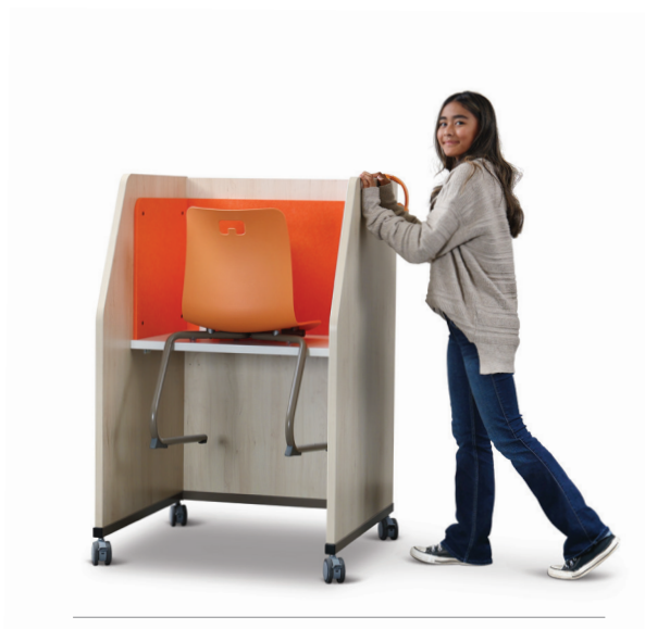
MLS, combined with E! Seating reverse cantilever, moves easily through doorways.