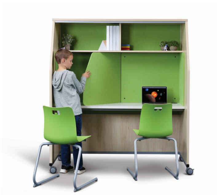
Articulating center screen transforms double MLS from collaborative to independent learning.