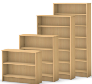
Fixed Bookcase – Single Sided Open, shelf quantity varies by height D: 12" W: 36, 48" H: 29, 42, 60, 72"