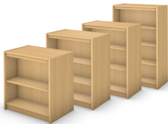
Mobile Shelf Storage – Double Sided Open, shelf quantity varies by height D: 24" W: 36.5" H: 36, 44, 48, 60"