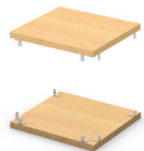
Shelf Storage Filler – Corner D: 12.6" W: 24"