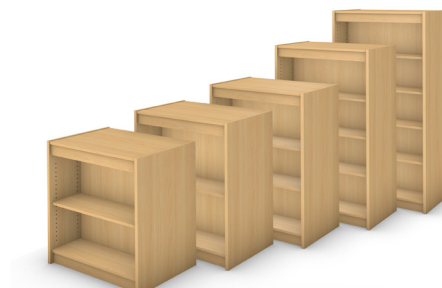
Fixed Shelf Storage – Double Sided Open, shelf quantity varies by height D: 24" W: Starters are 36.5" & adders are 35.5" H: 36, 42, 48, 60, 72"