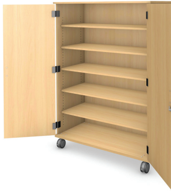
Tall Storage - Locking Doors 48"w x 68"h x 24"d - 97.1183 QS