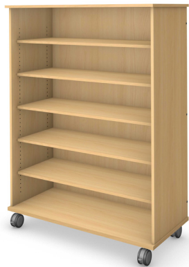
Tall Storage - No Doors 48"w x 68"h x 24"d - 97.1283 QS