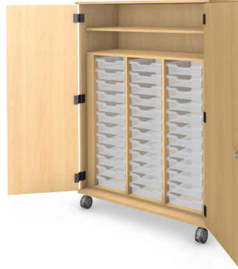
Tall Tray Storage - Locking Doors 36 trays - 48"w x 68"h x 24"d - 97.2909