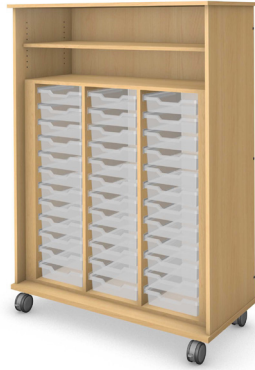
Tall Tray Storage - No Doors 36 trays - 48"w x 68"h x 24"d - 97.2919