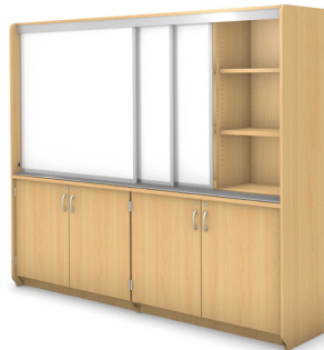
Learning Wall - Locking Doors 8' - 97.5"w x 84"h x 26"d - 60.010887 12' - 145.5"w x 84"h x 26"d - 60.011287 Option: Monitor/Technology package