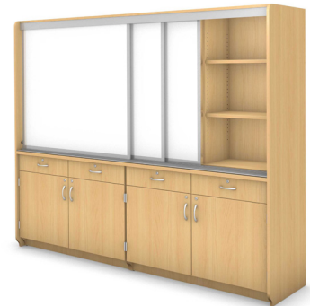
Learning Wall - Locking Drawers & Doors 8' - 97.5"w x 84"h x 26"d - 60.020887 12' - 145.5"w x 84"h x 26"d - 60.021287 Option: Monitor/Technology package

See our 2018 Finish Guide for additional laminate, edge and paint options.