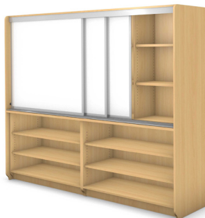
Learning Wall - No Doors 8' - 97.5"w x 84"h x 26"d - 60.050887 12' - 145.5"w x 84"h x 26"d - 60.051287 Option: Monitor/Technology package