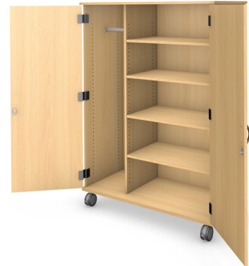
Tall Wardrobe Storage - Locking Doors 48"w x 68"h x 24"d - 97.1583