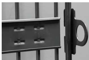
Hasp lock & identification holder