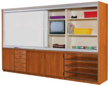
Full-depth sidewalls and shelving