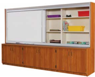
Partial sidewall with recessed shelving