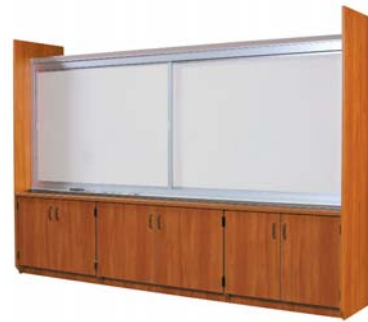
Recessed shelving with full-depth sidewall