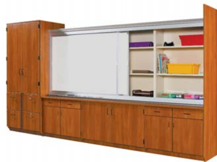
Additional end cabinet storage

Here are a few of the ways Learning Wall components can be selected and arranged. Use these configurations as "idea starters" to build your perfect meeting space.